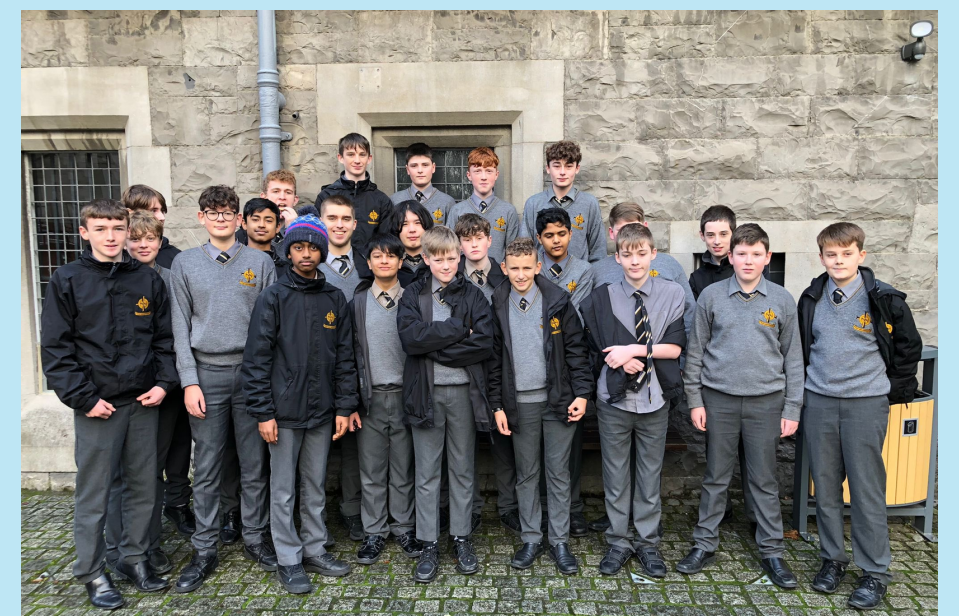
2nd year Dublinia trip