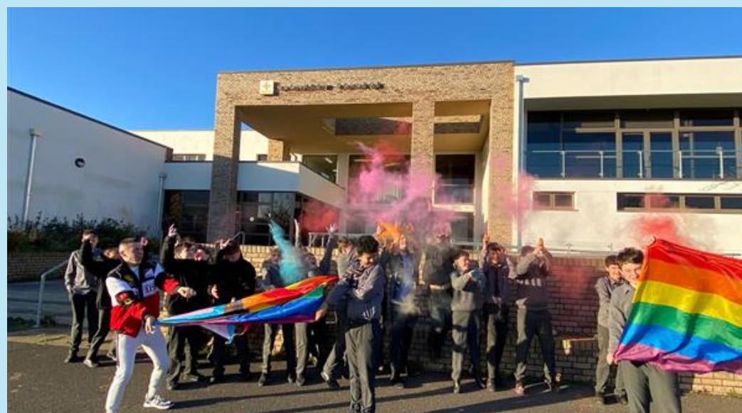
Stand up week