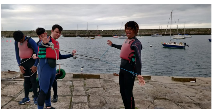
Transition Year Work Experience

Work experience dates for September-May 2021-2022: