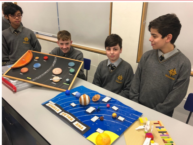
More of our fantastic solar system models