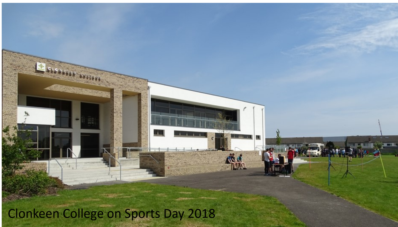
Clonkeen College on Sports Day 2018