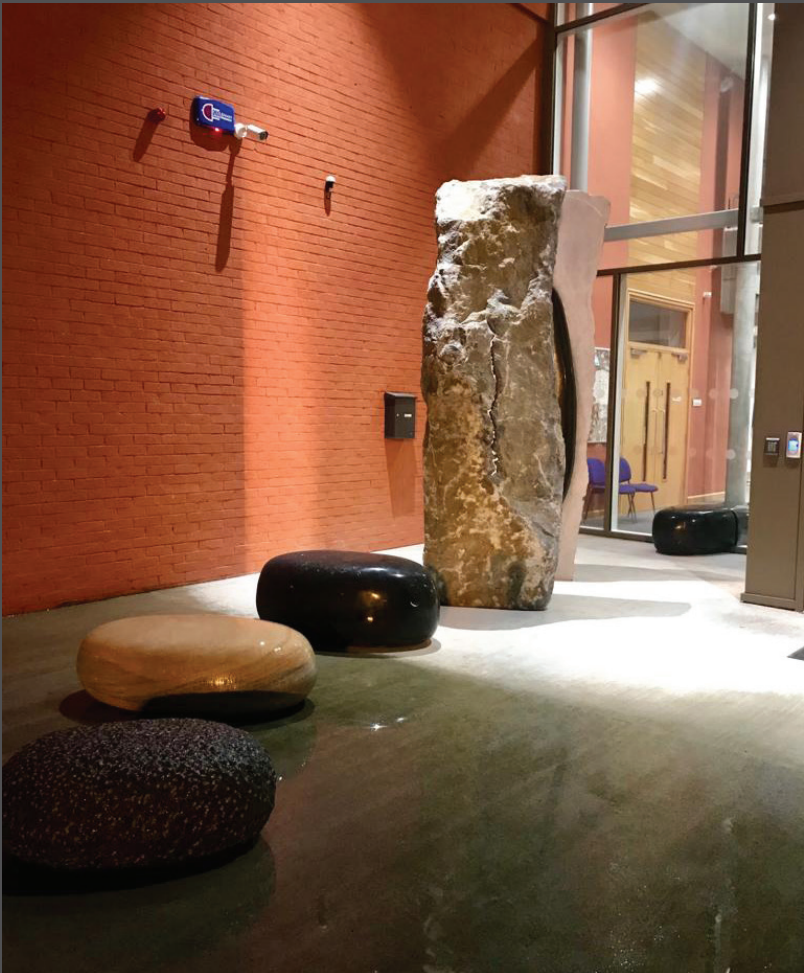
‘The Pinnacle’ 2018/19